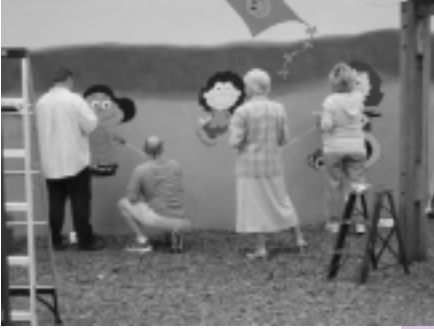
ValPak volunteers paint a mural in the shelter playground.