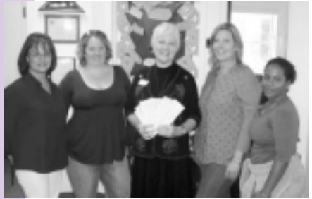
Verizon presents CASA with donations from "Shower for Shelter"